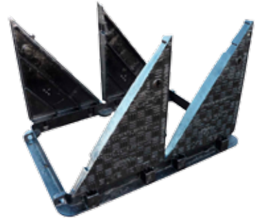
KDAX13 Fully Open