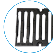
F 900 Grating