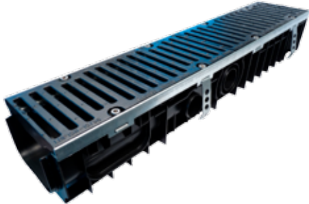
LIBERTY DRAIN™ 150