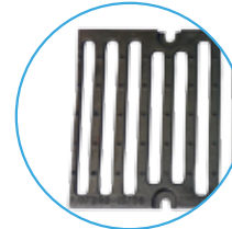
F 900 Grating