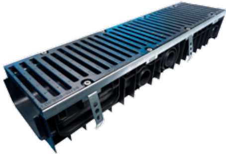
LIBERTY DRAIN™ 200