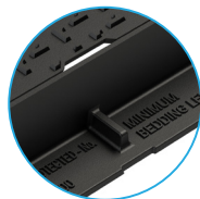
Minimum Mortar Line Indicator