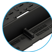
Minimum Mortar Line Indicator