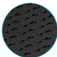
Patented '4L' Anti-slip Pattern