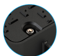
Cover Locking Point