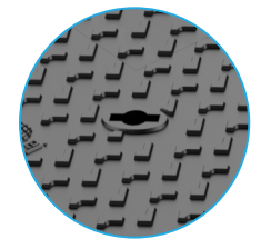
BS Keyways For Safe Operation