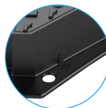
Minimum Mortar Line Indicator