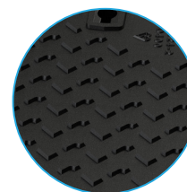
Patented '4L' Anti-slip Pattern