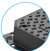
Blanked Locking point