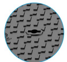
BS Keyways For Safe Operation