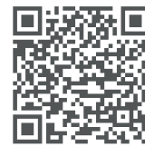
Sonolyzer app for Android smartphones

This is always based on an analysis of the system, for example, with a quick energy check performed in just 20 seconds: KSB Sonolyzer is the first app that hears whether energy can be saved.