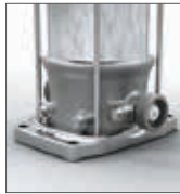
External thread Movitec VE