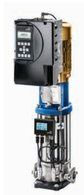
High-efficiency version of Movitec V equipped with KSB SuPremE® IE5* motor, PumpDrive and PumpMeter