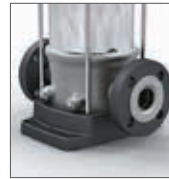
Round flange Movitec VF