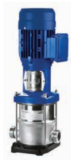
Movitec for connection with the VSV Victaulic coupling

In addition, KSB has available ground-breaking drive and automation solutions for the highly efficient operation of the pump sets. Movitec is equipped with the economical IE3 motors as standard, for example. Optimum energy savings can be achieved in combination with the KSB SuPremE® IE5* motor. Pump sets fitted with the PumpDrive speed control system and the PumpMeter monitoring unit add to ensuring demand-driven operation for absolute system availability.