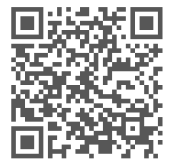
Sonolyzer app for iPhones