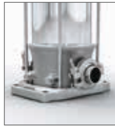
Tri-clamp coupling Movitec V(S)T