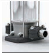
Victaulic coupling Movitec V(S)V