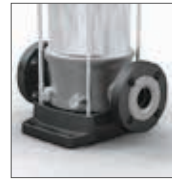
Round flange Movitec VSF