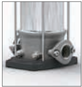
Oval flange Movitec V(S)

Movitec is available with different connection options so you can choose the design most appropriate for the applications in question. Movitec VE with integrated swing check valve makes KSB the only supplier in the market that offers a variant of this kind.