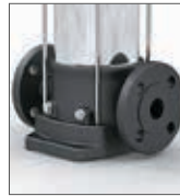
Round flange Movitec VCF